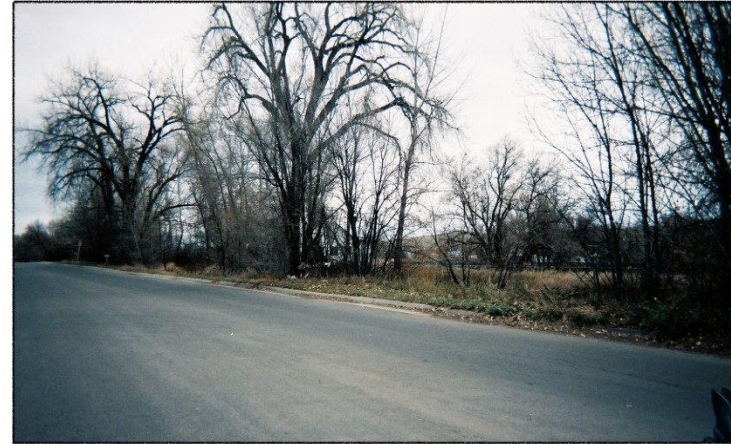
Rachel Martinez, Walsenburg, CO (Huerfano County)

People drive fast on this long busy street with big looming trees, no sidewalks, streetlights or speed bumps. At night it is dark and scary. Can we get solar lights, a sidewalk or maintained path through the dirt and weeds?